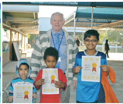
Jashua Iskandar Kindergarten